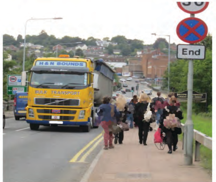
Chepstow A48 Bridge over River Wye – request for the Chepstow 30mph limit to be extended to cover the bridge.