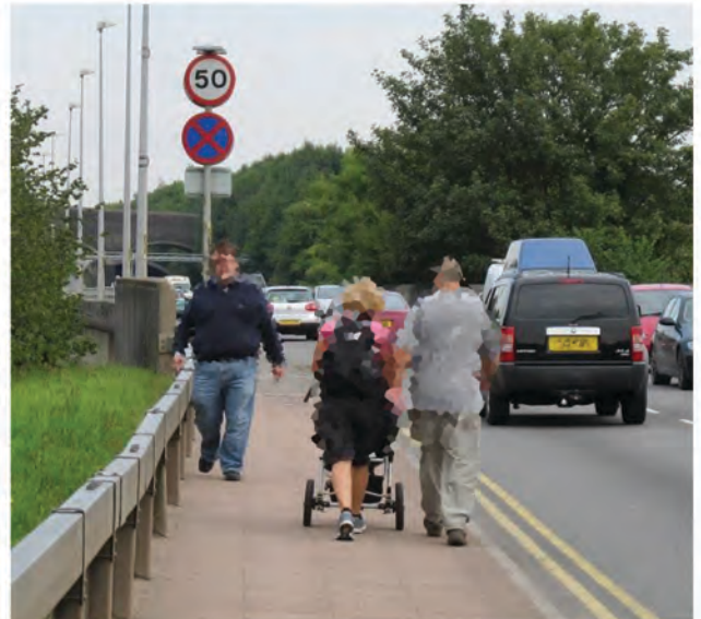
Railings would be help also, but 30 mph is essential.